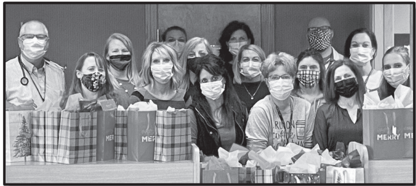
The Monument Health Clinical Research Department dropped off bags of fun items to the Women & Children's Home. They brought gift bags for the kids and makeup bags for the ladies. How fun!